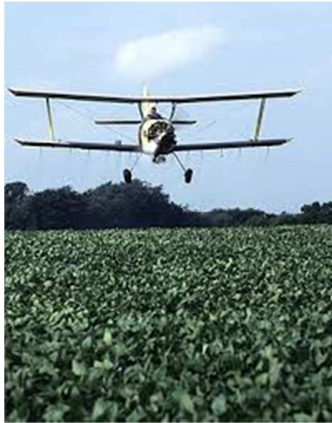
Figure 12. Aerial Pest Control System.