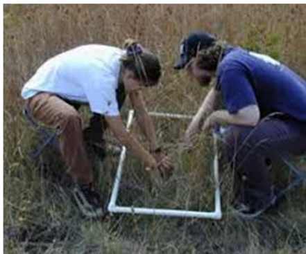
Figure 1. Point or square quadrant (Source: Google Photo).

This is measured by either using point quadrant or square quadrant [4, 13]). Point quadrant is a wooden square with holes. Metal rods of the quadrant protrude from the holes either vertically or at 45°. The quadrant is taken to the field and placed to the ground level. The number of plant species is observed and as many of each species that touch the metal rod are counted as shown in figure 1. If guinea grass touches it 6 times it is 60%. This is determined randomly for the other plant species and final averages are obtained. They are then oven-dried after sorting to obtain dry matter yield. Each of these are then expressed as dry matter in kg/ha. The nutritive qualities are then determined by chemical analysis and digestibility trials [20, 15]. All figures are that of internet pictures.