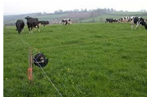
Figure 10. Fencing of Pasture Land Using Electric Wire.