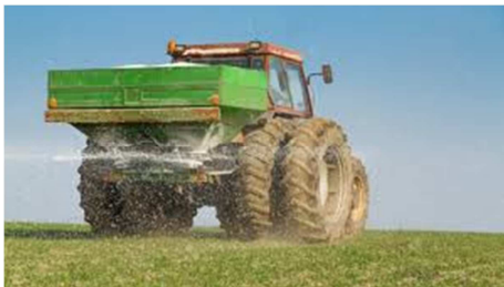
Figure 6. Mechanized Fertilizer Broad Casting System (Source: Google Photo).

Applications of fertilizer at the beginning of the rains, also, ensure luxuriant growth of the forage crops [5]. The fertilizer applied will improve the soil fertility, thereby encouraging plant growth as shown in Figures 6 and 7.