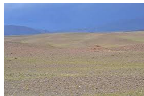
Figure 14. Over-grazed Pasture Land.