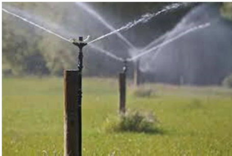
Figure 5. Fixed Sprinkler Irrigation System (Source: Google Photo).