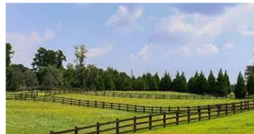
Figure 9. Fencing of Pasture Land Using Iron Bars.

Fencing enables the farmer to practice rotations and deferred grazing. It, also, prevents stray animals from grazing on the pasture [6, 20, 13, 15]. The fencing can be done by the use of stones, plants or electric wires as shown in Figures 9 and 10.