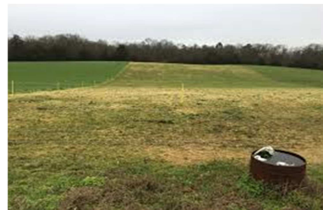
Figure 13. Sign of Over-grazing.

Intensive grazing thus causes the plant residual matter to decline and further contributes to numerous negative consequences to both the animals and the land [13]. Consequently, over-grazing signifies a serious environmental challenge in maintaining the natural balance of livestock on grazing lands, which eventually reduces the productivity, usefulness, and bio-diversity of the land (Figures 13 and 14).