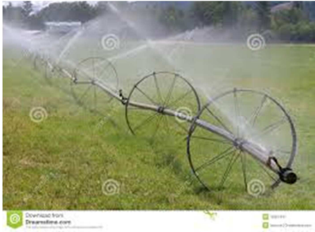
Figure 4. Wheel Line Irrigation System.

luxuriant growth and availability of feed throughout the year [6, 20, 13, 15]. The water applied will provide moisture to the forage crops in a pasture preventing them from drying up due to excessive transpiration (Figures 4 and 5).