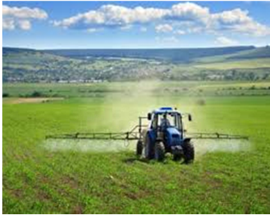
Figure 11. Mechanized Pest Control System.