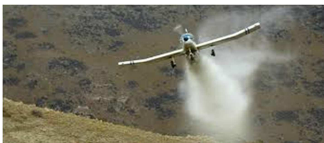
Figure 7. Aerial Fertilizer Application System (Source: Google Photo).