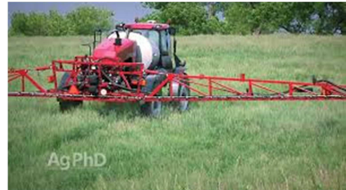
Figure 8. Mechanized Herbicide Application System.

Weeds should be removed at all times. This can be achieved by either herbicides or mechanical or manual weeding [8]. Where close planting is done, weeds pose less threat as can be seen in Figure 8.