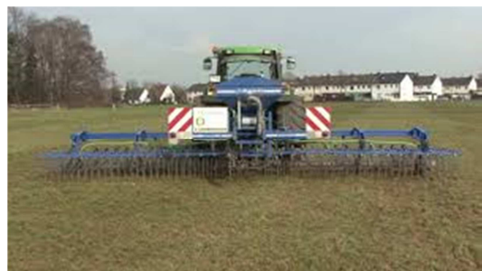
Figure 3. Mechanized Re-Seeding of Pasture Land (Source: Google Photo).

Where plant population has decreased appreciably, seeds may be sown through drilling or broadcasting at the beginning of the rainy season to replace the destroyed forage crops in the pasture as can be seen in Figure 3 [8].