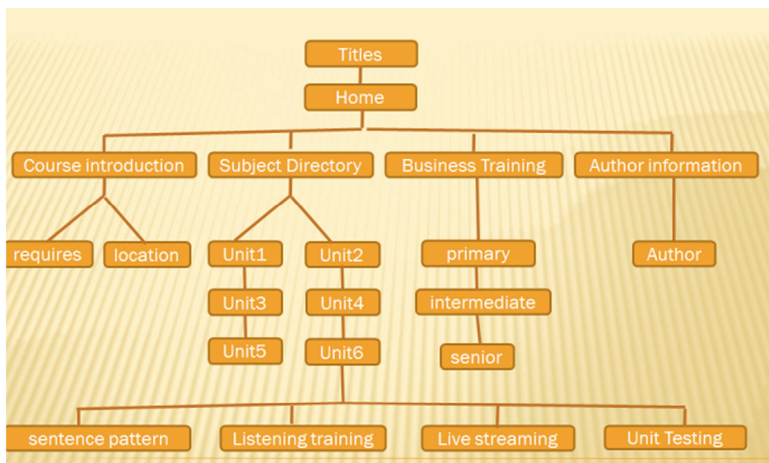
Figure 1. Main framework.