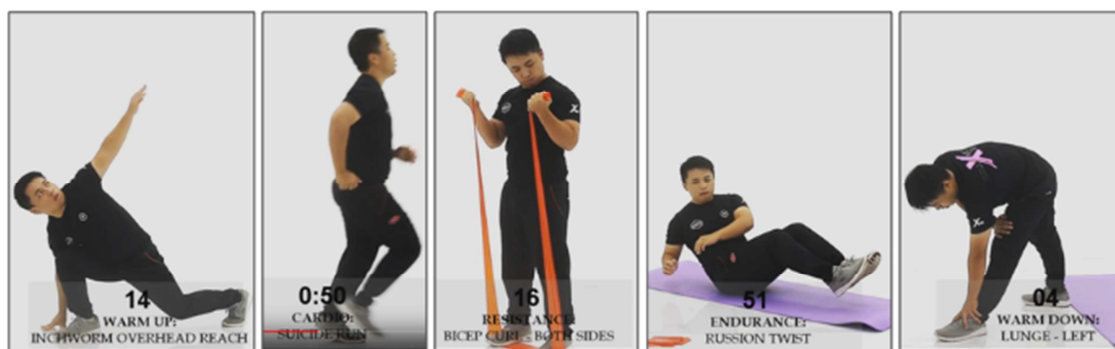
Figure 2. The exercise protocol encompassing four phases: dynamic warm-up; conditioning stimulus; and dynamic cool-down.