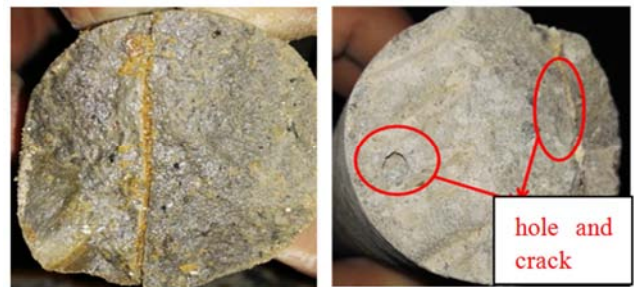
Figure 3. Concrete cracks and holes revealed by sidewall borehole.

At the same time, according to the data, the waterproofing measures of the project are imperfect, and the inspection results of drilling holes in the side wall show that there are many structural joints and honeycomb holes in the structure. These structural weaknesses are the positions where groundwater is easy to pass through. The weak links provide a channel for groundwater seepage, as shown in Figure 3.