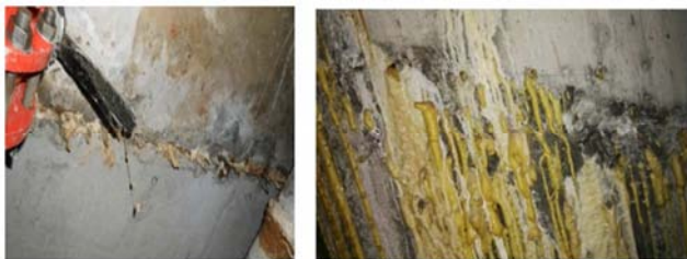
Figure 4. Roof and sidewall grouting.

According to the field investigation, grouting is mainly used to stop water in the early stage of emergency. The leakage points (including deformation joints) are grouted first, and then flexibly protected by polymer sealing materials, which are mainly used for roof and side walls, as shown in figures 4 and 5. According to the engineering geological conditions and the actual situation of structural seepage, the practical application effects of various grouting materials are compared. In the early stage of grouting, grouting materials including single-liquid foaming water-stop agent, polyurethane water-stop agent and rapid water-stop agent are mainly used. After their interaction with water, the grouting materials can rapidly expand and plug the cracks to achieve the purpose of water-stop.