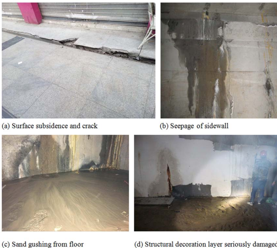
Figure 1. Seepage Photo in site.

The whole underground tunnel seepage phenomenon is serious, large-scale water and sand gushing mainly concentrated in the original structure deformation joints and construction joints, underground passage water and sand accumulation phenomenon is serious, field investigation found a total of 1828 seepage points. At the same time, the continuous scouring of water takes away the sediment in the surrounding soil of underground engineering, destroys the original structure of surrounding roads and buildings, and even causes surface settlement and deformation. Voids have appeared in many areas. Field deformation diseases are shown in Figure 1.