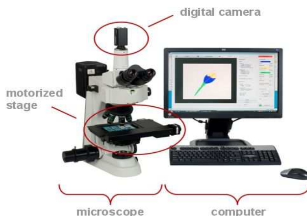
Figure 1. CASA test system

spermatozoon head. After converting these images into digital values, the system can draw a track for the spermatozoa head motility[8].