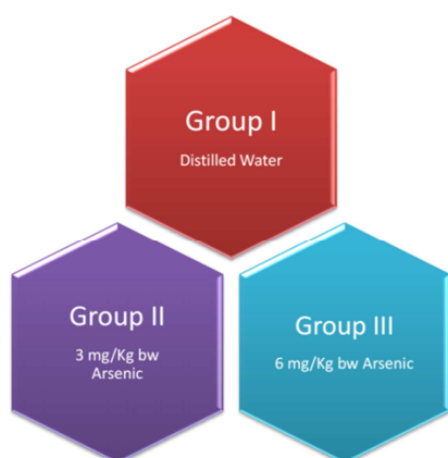
Figure 1. Division of Albino mice into different groups under experimental setup. Group I represents control mice. Group II and III represent exposed mice to different arsenic concentrations.

The mice were divided into three groups. Group I – Animals were given distilled water and kept as control. Group II – Mice were administered a single oral dose of 3mg/kg body weight of arsenic. Group III – Mice were given a single oral dose of 6 mg/kg body weight of arsenic. Mice were autopsied 15 days post treatment. Kidneys were removed and blotted dry.