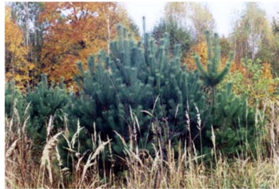
Figure 8. Young Group of a Pine.

Naturalness of group placement of trees in forest communities was directly or indirectly reflected in many works (Darwin, 1859; Scamoni, 1954; Schütt, 1957; Stephan, 1986; Rajanow, 1995; Rohmeder, 1959; Wright, 1937, 1951, 1976; Zaspel, 2002). Group placement of trees is applied in the Central Russian forest-steppe Upland (Figures 8, 9, 10).