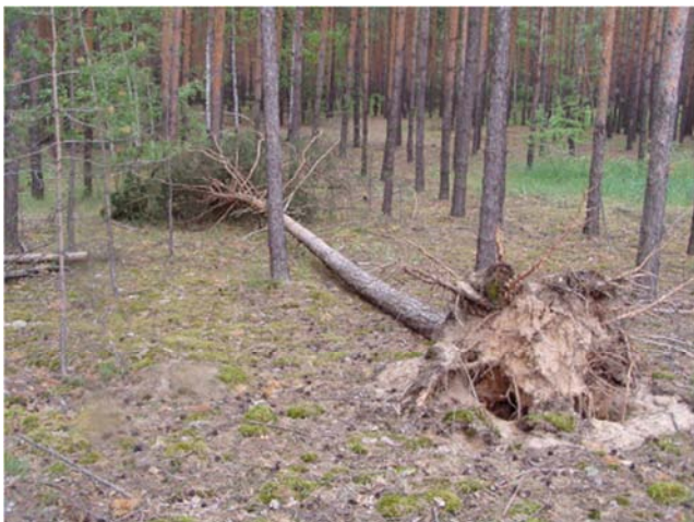
Figure 7. Dead Pine Tree (25-year-old) Infected by H. Annosum .

The pine monocultures (Figure 5) dominate. They are intensively damaged by pathogenic organisms (Figures 6, 7). Among pathogenic fungi in oak plantings the most mass is the Erysiphe alphitoides , causing oak powdery mildew, is a major foliar pathogen of Quercus robur . Young plants of a bass aged till 3 years die off. In mature trees the disease is generally less damaging, it can contribute to tree decline and reduce decorative effect of plantings. In pine planting fungus H. annosum . Annosum root rot is considered to be the most economically important forest pathogen in the Usmansky forest.