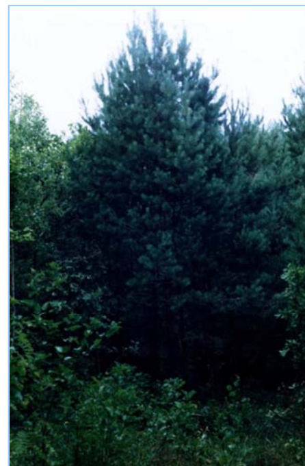
Figure 9. Middle-Aged Group of a Pine.