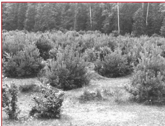
Figure 10. Group Planting of a Pine.