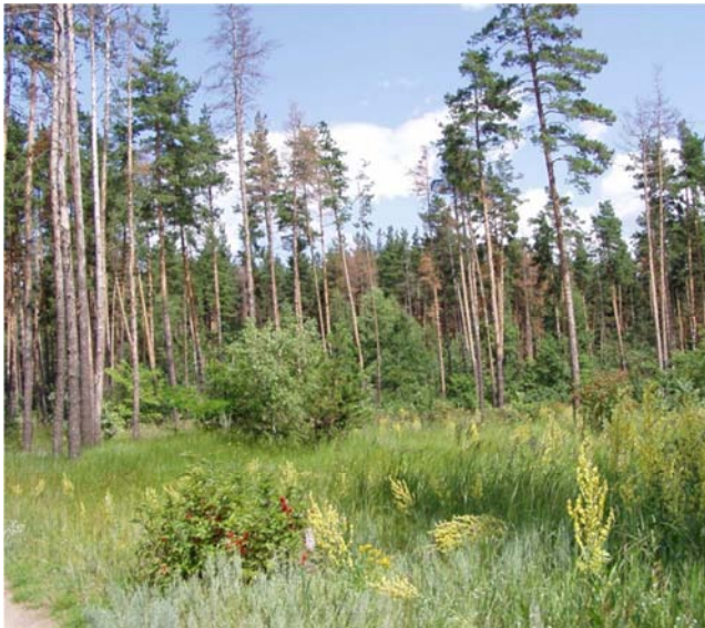
Figure 6. Dying off of the Pine Trees Caused of H. Annosum .