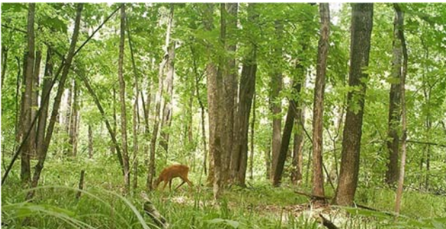
Figure 4. The Sites of Natural Wood.