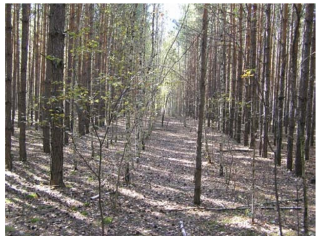
Figure 5. Pine Monocultures.

The tree species in Voronezh Nature Reserve are a combination of pine (32.3%, oak (29.3%), aspen (19.3%), birch (5.7%), black alder (5.2%).