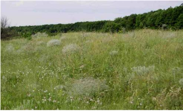
Figure 3. The Sites of Virgin Steppe.