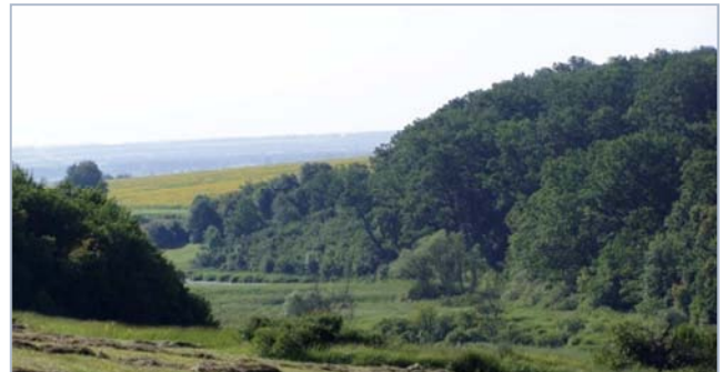
Figure 1. Typical Landscape of the Central Russian Forest-Steppe.

example, noticeable warming and moistening of weather conditions caused a mass invasion of an Ash borer ( Agrilus planipennis ) who promoted mass dying off a European ash ( Fraxinus excelsior ). The climate here becomes specific: the typically Russian continental winter with thorny frosts and large mountains of snow and dry hot summer winds they were replaced by long thaw, fogs, and small-drop rains. In general, present weather reminds sometimes the subtropical climate. Precipitation varies from 700 millimeters in the northwest to 650 millimeters in the southeast. But they are very uneven and irregular.