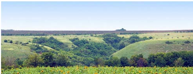
Figure 2. Ravines in the Central Russian Forest-Steppe.

Erosive processes in the territory of the Central Russian forest-steppe are very active (Figure 2).