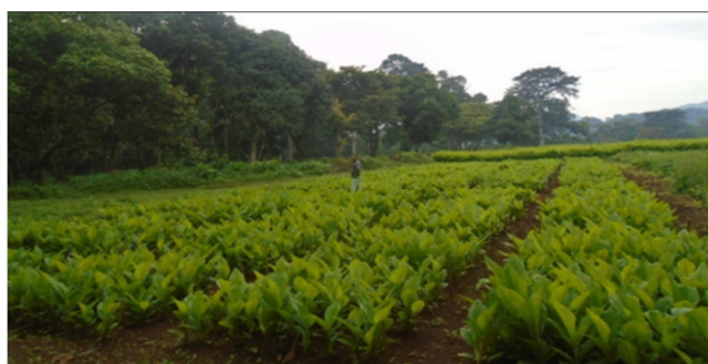
Figure 2. View of the experimental plots at tillering stage.

The treatments consisted of five levels of nitrogen (0, 46, 69, 92 and 115 Kg ha -1 ) and five equal split applications of nitrogen. The time of nitrogen application were adjusted according to Ravindran et al. [8] growth stage for turmeric plant. Accordingly, the timings of N application were adjusted as follows: first time of application (full dose at emergence); second time of application (half at emergence, half at lag growth stage); third time of application (1/3 rd at emergence, 1/3 rd at lag growth stage and 1/3 rd at tillering stage); fourth time of application (1/4 th at emergence, 1/4 th at lag growth stage, 1/4 th at tillering stage and 1/4 th at slow growth stage) and fifth time of application (1/5 th at emergence, 1/5 th at lag growth stage, 1/5 th at tillering stage, 1/5 th at slow growth stage and 1/5 th at crop approaching maturity stage). At crop emergence, urea was drilled between rows and incorporated into the soil immediately based on the treatments. The second, third, fourth and fifth equal split N urea applications were done by side dressing at the specified growth stages of the crop: at the beginning of July, August and September, and at the end of October, 2016, respectively.