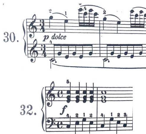
Figure 7. Added bass key in left hand as well as double lachen notes.

"but in Czerny etudes is the rapid movement of Crescendo and piano or pianissimo, which is problematic." [7]. From lesson 32, the left hand is written with the bass key (F) (Figure 7). At first, the notes of an octave lower than the middle two with quarter notes in the form of forte (strong) and the right hand of the melody are presented as triangular chords, lesson 33 with sixteenth rhythmic figurative and the measure of quarter and half notes in the first period and in the second period of the right hand double quarter notes and in the hand The left is brought in sixteenth and half, which makes the student familiar with a variety of rhythmic states. Also, Czerny completes this exercise in the form of the first period in the form of forte and the second period, first the piano and after The Crescendo with Forte Cadence [8].