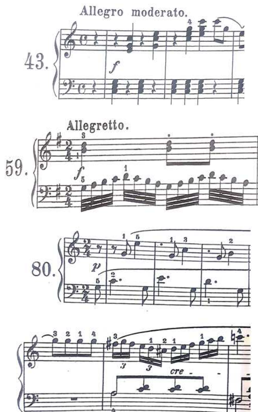
Figure 9. Practice of rhythmic figurative of three lachens and trills as well as added branch.