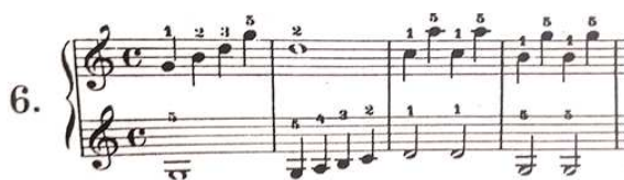
Figure 2. Added quarter notes and change of hand position.

In lesson two, Czerny considers notes above five G clef lines up to note C 2 for student practice. Practice 3 and 6 of this etudes is in the position of scale of the G major (without the use of the key signature and F seighth). Therefore, the position of the hand has changed so that the student does not get used to a situation and does not give the wrong impression in his mind that some fingers are always used to hitting certain notes. (Figure 2). In the first 10 practices, whole, half and quarter notes are intended for the basic recognition of the elasticity of notes and rhythmic values, from the first exercise to the fourth exercise, round and half notes are used, and five to seven quarter notes are added. In lesson 8 (Figure 3), a three-voiced material in the right hand is on the agenda to identify the detached intervals and start the exercise in the jump notes. In practices no. 9 (Figure 3) and 10 (Figure 4), these broken chords have been used.