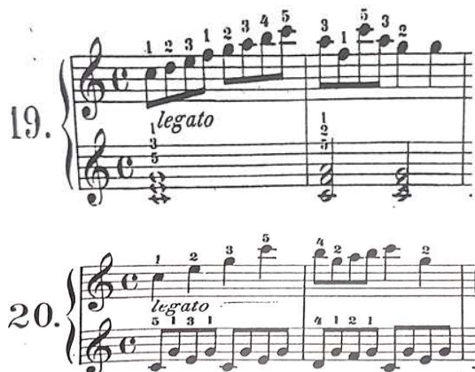
Figure 6. Opening the right hand up to an octave and stepping as well as more speed.

practice (Figure 5) in the left hand of figure basso ostinato (hard bass). 12 "This typefaces, composed of repeated repetition of a melodic figure" [6]. In this left hand exercise using two tonic chords (C major) and dominant (G major) is used in a two-part form with a repeating structure and in the right hand the melody is presented in the form of double quarter notes (except cadence) and in the cadence part with the dominant connection to the tonic in each The period is over. From lesson 19 to lesson 20, he has written practices for thumb in simple and compound meter. The 19th lesson (Figure 6) rotation of the thumb under the third finger for hitting the scale C major is designed in such a way that the student can easily communicate with the melody and prepare for the scale, the 20th lesson (Figure 6) of the right hand by opening the fingers to hit the notes in an octave in the right hand, as well as using figure busso ostinato and using more chords. Designed.