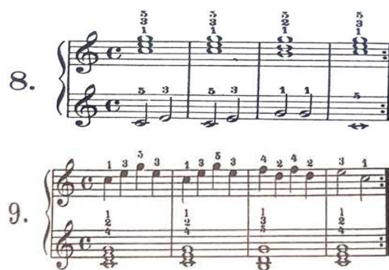
Figure 3. Using melody and accompaniment chords as triads.

In lesson two, Czerny considers notes above five G clef lines up to note C 2 for student practice. Practice 3 and 6 of this etudes is in the position of scale of the G major (without the use of the key signature and F seighth). Therefore, the position of the hand has changed so that the student does not get used to a situation and does not give the wrong impression in his mind that some fingers are always used to hitting certain notes. (Figure 2). In the first 10 practices, whole, half and quarter notes are intended for the basic recognition of the elasticity of notes and rhythmic values, from the first exercise to the fourth exercise, round and half notes are used, and five to seven quarter notes are added. In lesson 8 (Figure 3), a three-voiced material in the right hand is on the agenda to identify the detached intervals and start the exercise in the jump notes. In practices no. 9 (Figure 3) and 10 (Figure 4), these broken chords have been used.