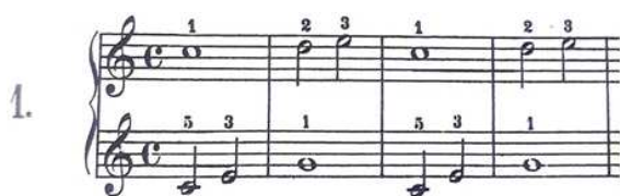
Figure 1. Questions and answers with round and half notes.

One to ten Czerny practices are intended to familiarize the student with G clef notes. These practices initially teach the student from C 1 to G 2 in order to stabilize these notes more in the mind of the student, stretched (whole note and half note) sounds are used repeatedly. (Figure 1)