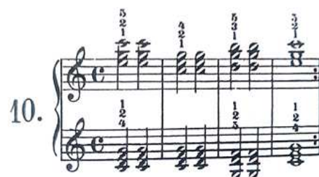
Figure 4. Using triad chords as footy and upside down in both hands.