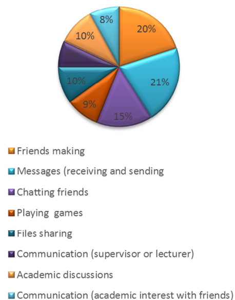
Figure 1. Students' reasons for using SNSs.

9% use SNSs to play games and 10% use it to share files. 7% use SNSs to communicate with either their supervisor or lecturer and 10% use it for academic related discussion. 8% use it to communicate academic interest with friends.