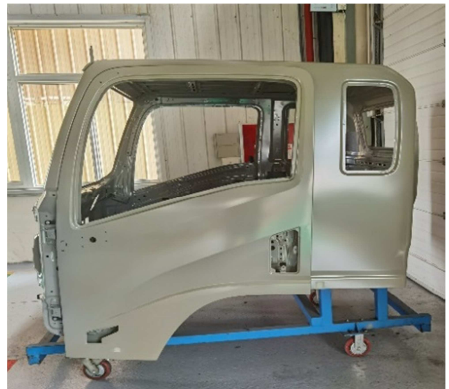
Figure 1. Commercial Vehicle Body Construction.

outer surface is reduced while the thickness of the paint film in the inner cavity is increased, resulting in a reduction of the total consumption of electrophoretic coatings on a single vehicle compared to the conventional electrophoretic coatings.