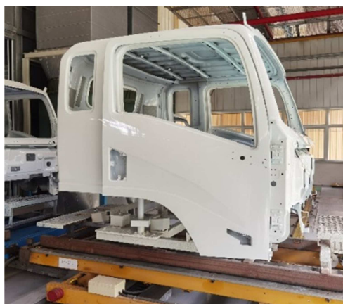
Figure 3. New Process Topcoat Appearance.