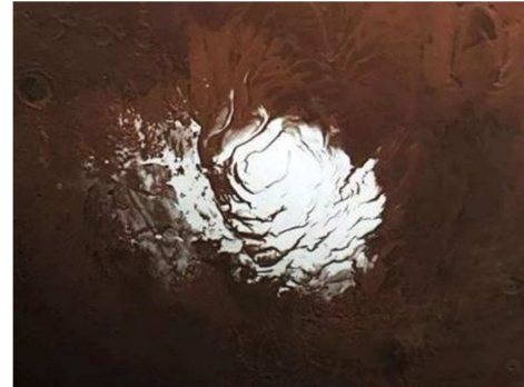
Figure 5. Martian ice sheet.

water droplets, therefore it is difficult for polar vortices to form strong spiral current, hence no apparent magnetic field or aurora can be detected. Because of the different appearance of Mars at night and during the day, Mars has been known as "bewilder" since ancient times.