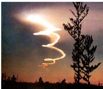
Figure 2. Earth's polar spiral currents.

Since the cloud clusters involved in polar vortex are numerous and revolve downward rapidly in a spiral manner, a series of thick spiral cloud bands can be formed, which facilitate not only the downward flow of heavier negatively charged water droplets but also the transfer of charge. Hence, this kind of cloud band is a good circuit with excellent electrical conductivity. In addition, with a large number of