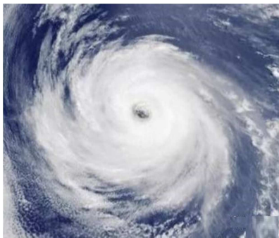
Figure 1. Earth's polar vortex.

The Earth is surrounded by a thick atmosphere, but the strong centrifugal force produced by the rapid rotation of the Earth makes the clouds over the equator and low latitudes tend to move away from their orbits to the South pole or the North Pole. Since the radius of the two poles of the Earth is less than the radius of the equator and other places, and the gravitational force is inversely proportional to the square of the distance, the gravitational attraction of the polar position is greater than that of other locations. When the clouds move above the polar regions, they are easily attracted by the gravitational pull of the polar regions, after inhaling cold air, they condense into thick clouds and sink gradually. Many polar-plunging clouds form a strong circulation around the pole as the Earth rotates, that is polar vortex, as is shown in Figure 1. The Earth has two group of vortices, located at the South pole and the North pole respectively, which can span troposphere and stratosphere. When the Arctic is in summer and its vortex structure become weaker than in winter, the Antarctic is in winter and its vortex become stronger than in summer, and vice versa.