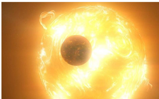
Figure 3. Mercury is magnetized by the Sun's magnetic field.

However, the space probe Mariner 10 launched by NASA in the 1970s found that Mercury did exist a weak magnetic field, which is probably a dipole magnetic field like the geomagnetic field, surrounding Mercury, but the magnetic field in the northern hemisphere is much stronger than that in the southern hemisphere. Because Mercury's magnetic field is very similar to the Earth's magnetic field, and its polarity is the same, that is, the south pole of Mercury's magnetic field is in the northern hemisphere of Mercury, and its north pole is in the southern hemisphere. Therefore, some people believe that the origin of Mercury's magnetic field should be similar to that of the Earth's magnetic field, that is, the flow of conductive fluid in the core of the star produces Mercury's magnetic field [4, 5]. However, such a hypothesis cannot explain the magnetic difference between the two hemispheres.