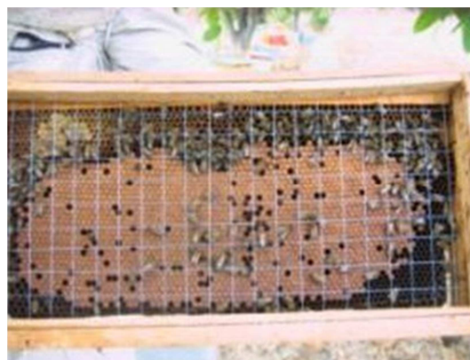
Figure 1. Grid frames placed over brood comb.

The area occupied by immature worker honeybees (eggs + larvae + capped brood) in each colony was evaluated every 21 days by overlaying a 5 \times 5 cm wire grid frame on each side of every brood frame and the area covered with the brood was visually summed [7] (Figure 1).